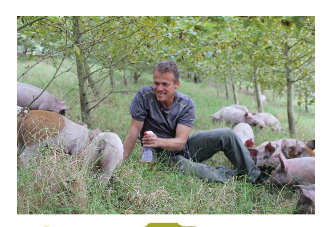
The sows are my colleagues